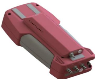
Active Vent Adapter incl. magnetic mounting