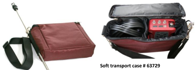
Soft transport case # 63729