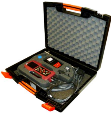
Standard ABS Transport case # 63319