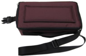
Arctic, unheated transport bag # 63730