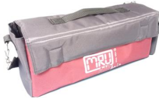
Soft transport case # 11507