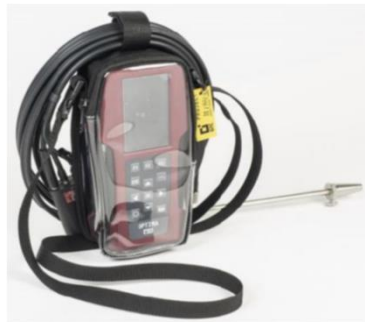
Operator carrier bag # 14361