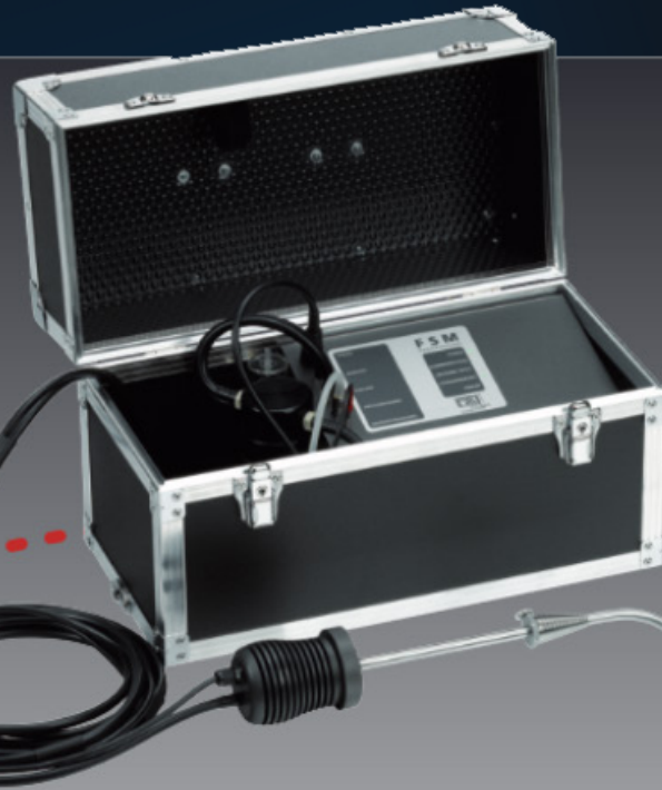
FSM Case for collecting particulate matter