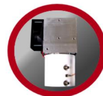
Thermoelectric gas cooler Peltier type