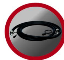
Gas sampling line Teflon, heated with temperature regulation