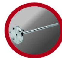
Gas sampling probe LD unheated, with in-situ sintered metal filter